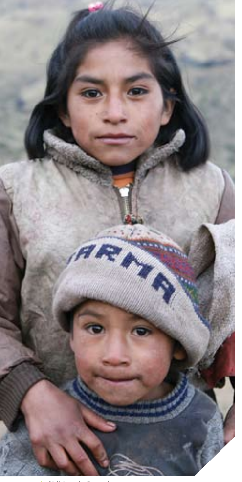
Children in Peruvian mountain village

full-time on them every day since then and will continue to do so for the rest of my days.