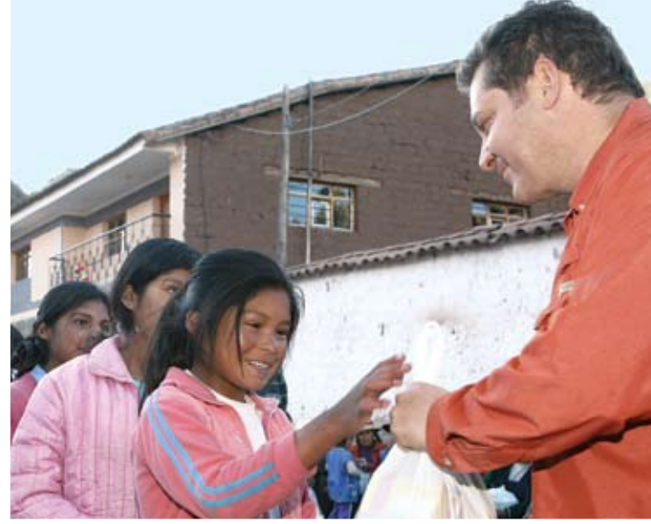
Bringing food to a remote mountain village in Peru