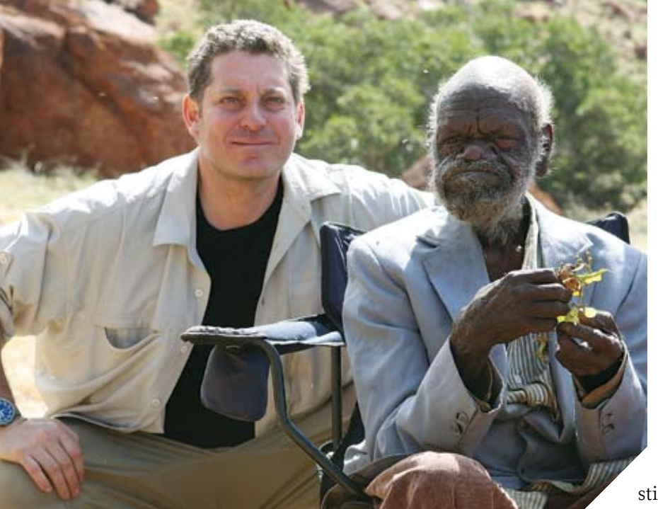
In central Australia with Aboriginal elder

entry-level job, and opportunities for good jobs, especially in growth sectors such as technology, were not exported overseas. People got hired based on talent, intelligence, and desire to succeed.