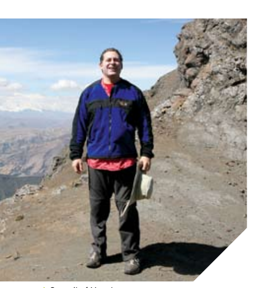
Summit of Mount Pachatusan in Peru, elevation 15,930 feet

and the industries and media they control have prevented the unification of the youth around a common purpose.